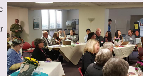
Enthusiastic attendees reunite with others who share a love for CoPS.