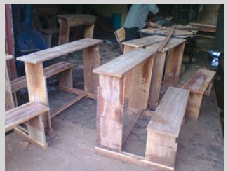
2011 CPS received new desks