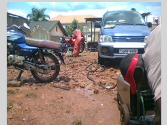
CPS Car washing bay