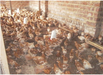
After two months old