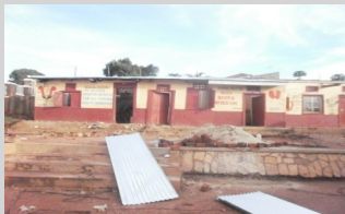
Before the renovation

Before, During and After Construction at the Circle of Peace School February 2013