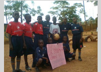
CPS Soccer Team