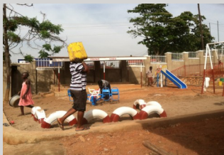
After renovation we have a new play ground, new floor, news windows. Teachers now have new desks. All classrooms are repainted.