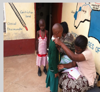
Students taking measurements for their new uniforms