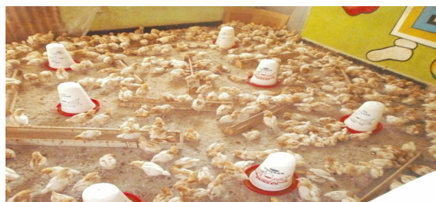
February 2013 we purchased 1,100 chicks at the DDCF for the school we're very excited on the progress of the poultry.

On behalf of Circle of Peace School board, staff, faculty, and the Bbaale family, I am very pleased to report that in