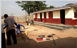
During construction Solomon and Charles are in charge of the project. They're working hand in hand with the workers